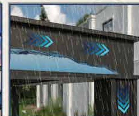
Integrated Rain Gutters