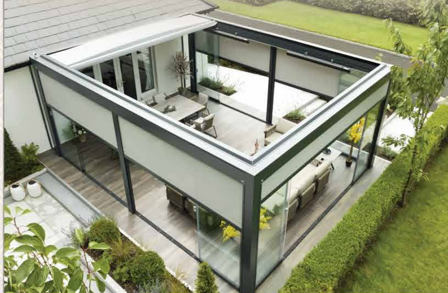
Fixed & Sliding Glass Walls