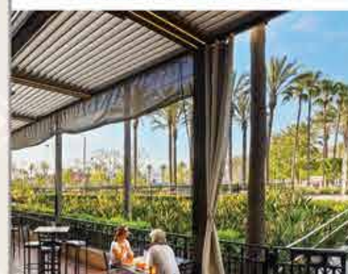
Roller Shades: Free-Hanging, Zipper Track, or Storm Rail