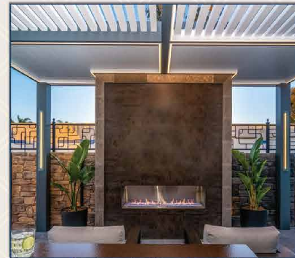
Fireplaces, Fire Pits and BBQ Grills