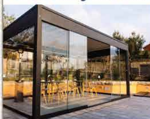
Fixed & Sliding Glass Walls