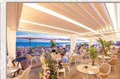
Louvered roof with LED lighting channel