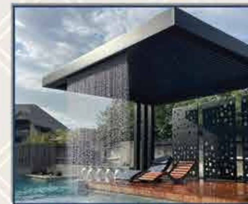
Sheer Rain Curtain