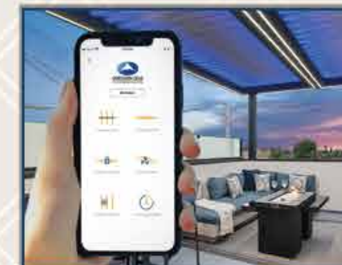
Smart Control App