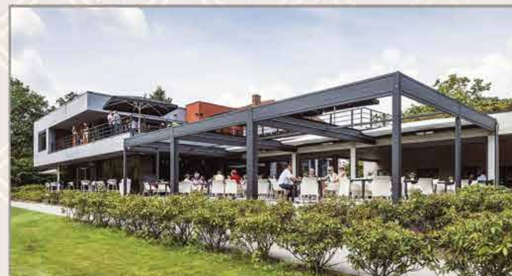
Motorized pergola covering outdoor patio restaurant seating