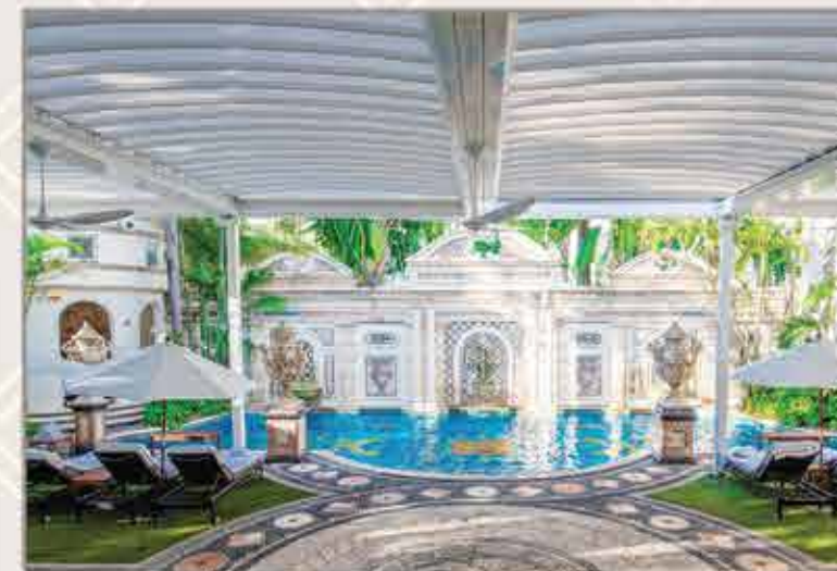
Retractable pergola with LED lighting and cooling features