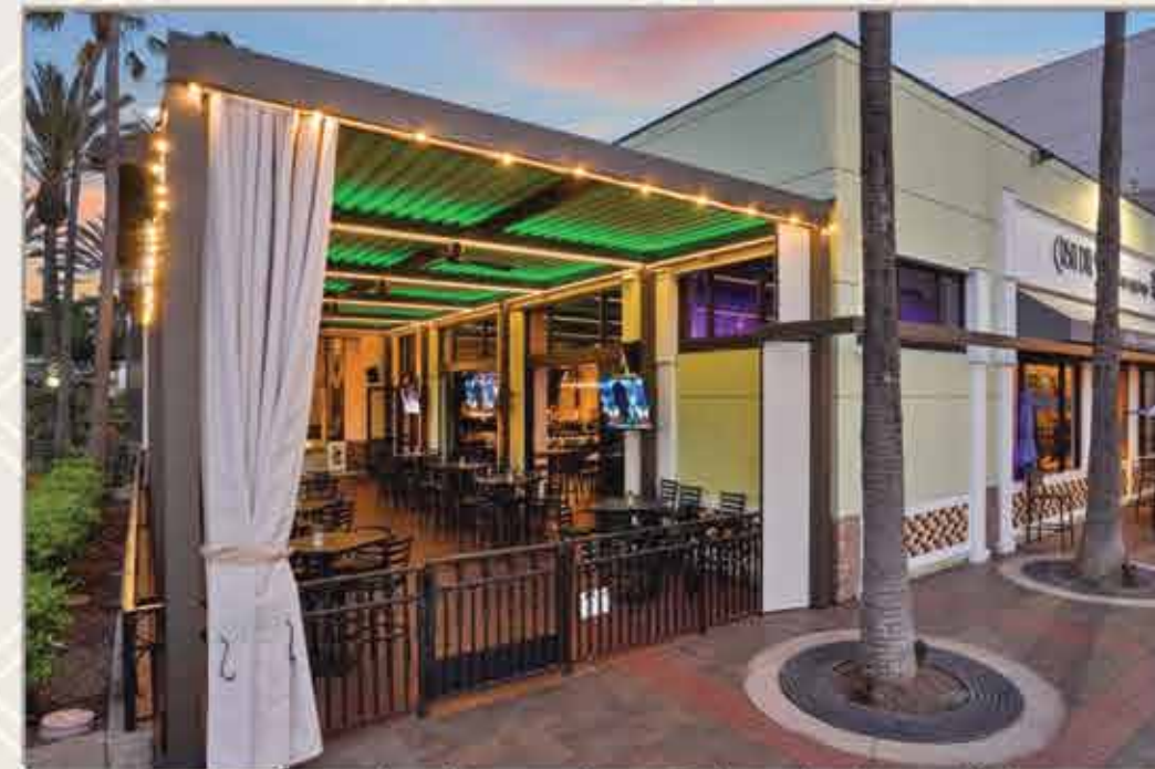
Expansive louvered roof, curtains, fans, LED channel and internal lighting