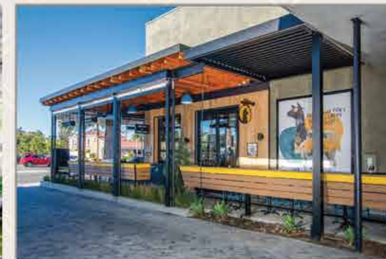
Combination louvered roof with LED lighting channel