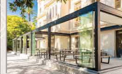
Louvered pergola with sliding windows